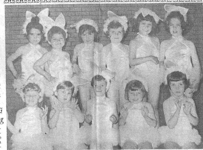
PART OF THE CAST of Showcase U.S.A. Dance Revue are these lovely young ladies who are prepared to entertain both young and old with their dance.